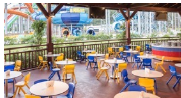
RIXY KIDS CLUB RESTAURANT